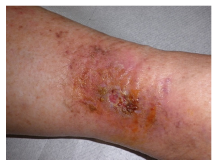
Fig. 6 : C<sub>6</sub>: Active venous ulcers