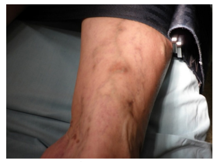
Fig. 3: C<sub>4a</sub>: Pigmentation/Eczema